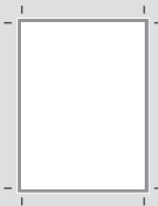
INSIDE BACK COVER AND BACK COVER 17.5 x 27 cm. (+0.5 cm surplus per side)