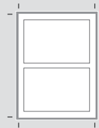
HALF PAGE HORIZONTAL 12.4 x 11.8 cm